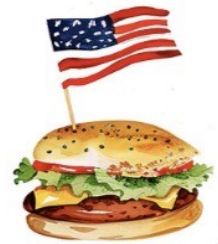
Hamburgers & Veggie Burgers

This event is provided by "Faith & Fellowship" as part of our commitment to building community and fellowship within our church family.