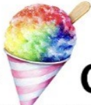
Regular & Sugar Free Shaved Ice